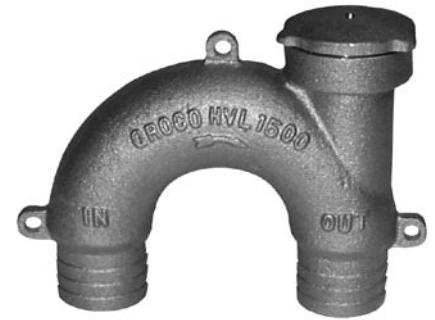
HVL Series is for Hose Connections

Service Note: An unavoidable dimensional change during early production has current replacement check gasket #VL-1504 slightly smaller in diameter than the gasket you may be replacing. In this case, in order to prevent the gasket from falling out during reassembly, apply a drop or two of marine caulk to the outer rubber ring only to hold it to the bronze cap while the parts are being screwed together. (The concave side of the check gasket faces the liquid).