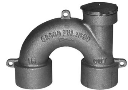
PVL Series is for Pipe Connections