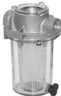
ARG-P SERIES Non-metallic basket

Installation Consideration: Strainers are usually installed below the waterline where pump priming is easier, hose runs are shorter and air leaks are minimized. However, a vertical installation above the waterline location reduces the possibility of water leaks and simplifies routine maintenance. GROCO strainers may be installed in either location. 1/2" to 1-1/4" have a separate upper bracket; fasten the bracket to a sturdy surface, then hang the strainer in the bracket to mark the position of the lower bracket (1" above the drain plug). Remove the strainer from the upper bracket to drill the holes for the lower bracket. Mount the lower bracket open-side up. Hang the strainer in the upper bracket (sight glass resting against the lower bracket pad). Run the releasable strap around the sight glass, engaging the lower bracket, and pull hand-tight.