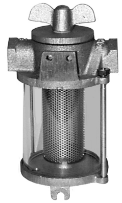
SA Series has a Lucite Sight Glass