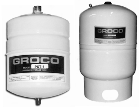
PST-1 or PST-2

Check the PST air charge (with no water pressure present) at least monthly.